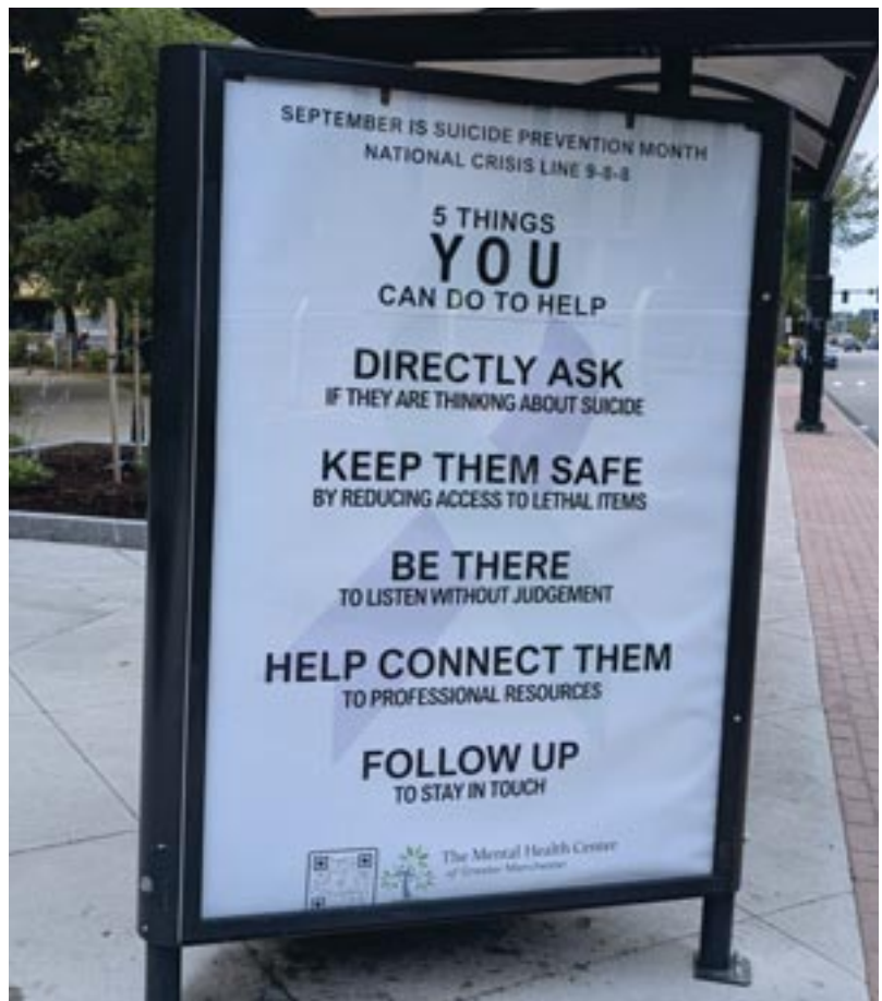
Bus Shelter on Elm Street in front of Veteran's Park