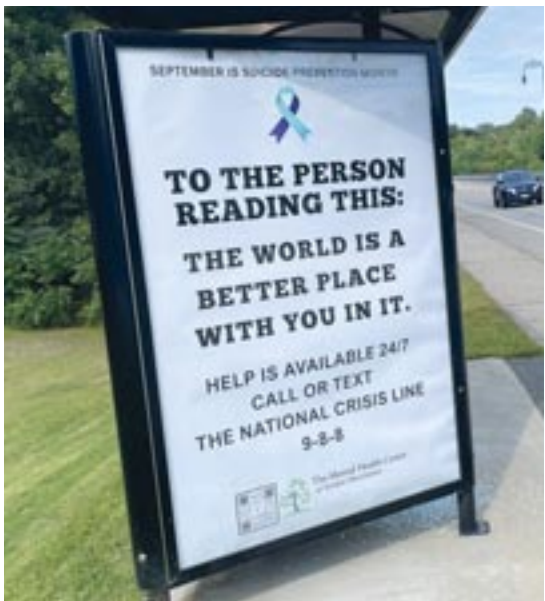
Bus Shelter at Agnes and Pinard Streets