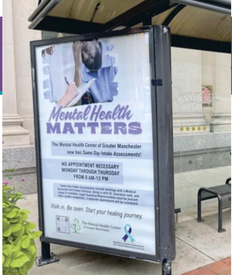
Bus Shelter on Elm Street in front of Citizens' Bank

In September for Suicide Prevention Month, Funds from our Zero Suicide grant enabled us to display our impactful messages in Manchester on a banner across Elm Street, three billboards, and four bus shelter posters.