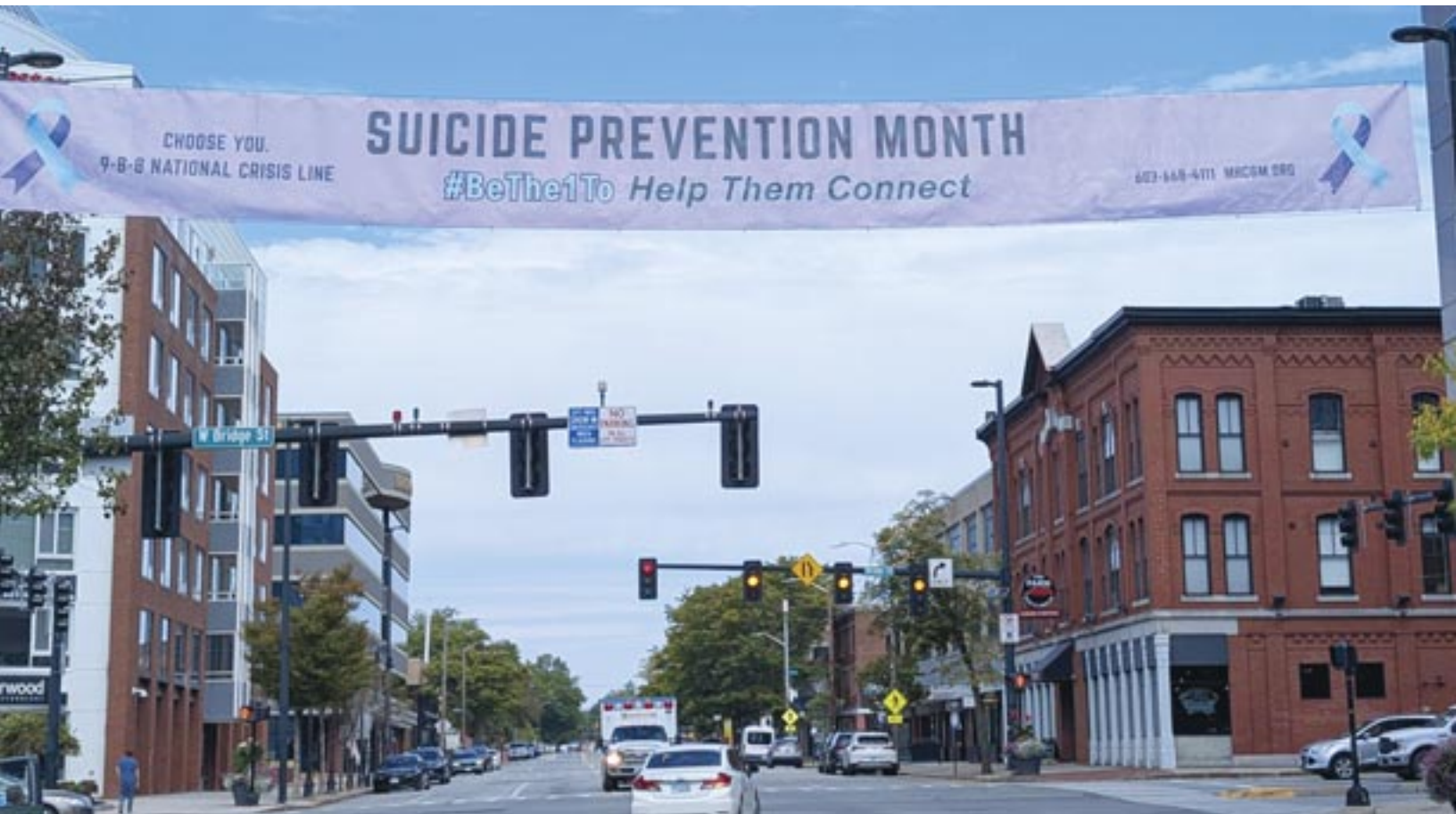
The banner hung at the intersection of Elm and Bridge Streets to raise awareness for Suicide Prevention