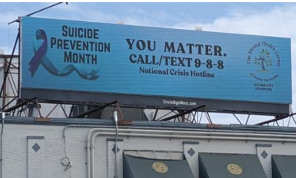
Billboard facing Market Basket on Elm Street in Manchester