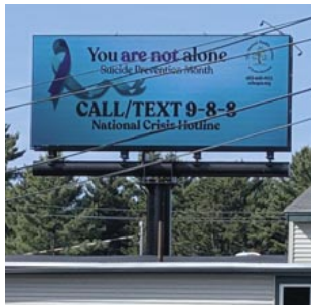
Billboard at the Candia Road-Massabesic Traffic Circle